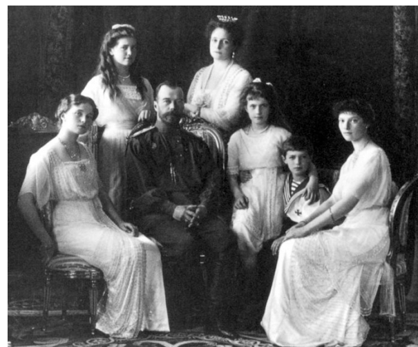
Figure 4 The last Russian imperial family. Left to right: Olga, Maria, Nicholas II, Alexandra Fyodorovna, Anastasia, Alexei and Tatiana. Portrait by the Levitsky Studio, Livadiya, Ukraine.