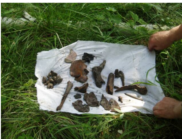
Figure 2 Skeletal remains and archeological artifacts recovered from the 2007 site.

The approach to the DNA testing by Gill et al. [7] was twofold, using autosomal STRs and mtDNA sequencing of the two hypervariable regions (HVI and HVII). STR testing was used as a sorting tool to distinguish each skeleton and show the putative familial relationships among the remains. At the time of the DNA testing, autosomal STR markers were in their infancy. The FSS