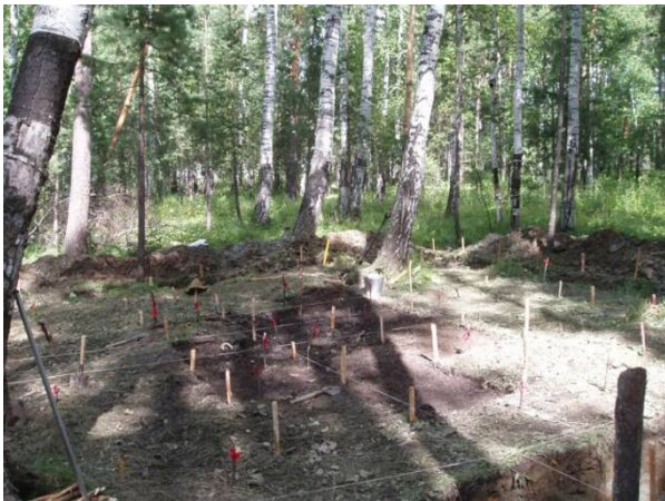
Figure 1 Excavation of the site where three amateur archeologists discovered the remains of the two missing Romanov children in the summer of 2007.